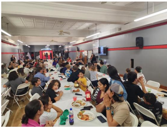
Annual year end banquet in November