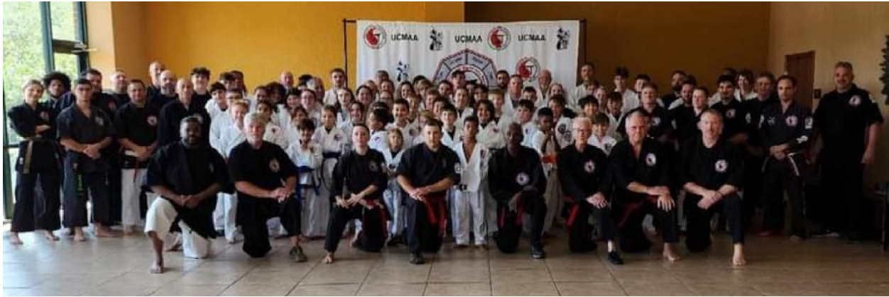
2023 UCMAA 5th National Seminar Participants (Front Row: UCMAA Board)